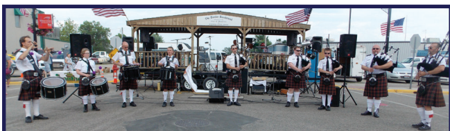
Fort Frances Highlanders