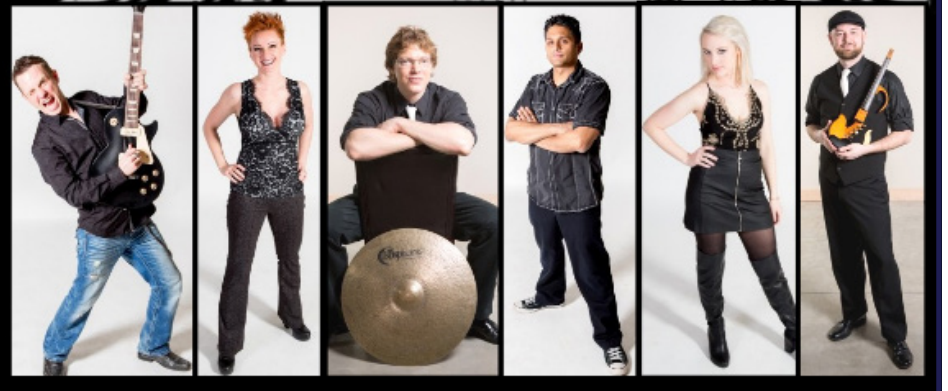
SHIRTS & SKINS